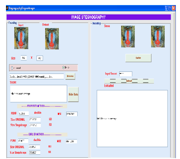
Figure 6.2 Decoding Phase (a) processed image (b) secret key (c) Secret message is extracted

into the cover image. In text box, "Data has been added to The above figures show the results of the proposed and earlier work on an image. In the earlier method the value of PSNR is low and value of MSE is high. The results obtained using the proposed method are best as compared to earlier technique.